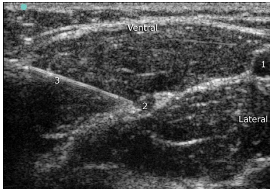
Fig. 1. Cross section of left cubital fossa using 12 mHz, 38 mm ultrasound probe demonstrating brachial artery (1) and median nerve (2).

the flexor retinaculum of the wrist was made based on post-surgical scarring at the wrist, along with significant tenderness over the median nerve at that site. On a return visit, pulsed radiofrequency of the left median nerve was scheduled under ultrasound guidance. Following the application of standard monitors with the patient supine on the procedure table, the left cubital fossa was prepped with betadine and draped. Sonosite Micromax II, utilizing a 12 mHz 38 mm linear probe, was used to identify the median nerve in cross section medial to the biceps tendon and brachial artery (Fig. 1). Skin was anesthetized with 1% lidocaine and a 54 mm radiofrequency probe with a 4 mm active tip was directed under ultrasound guidance to the ventral surface of the median nerve. The median nerve was stimulated at 2Hz and 0.3mA and contraction of finger flexors was observed. Pulsed radiofrequency (PRF) was applied at this point at a temperature of 42 degrees Celsius for 90 seconds. During application of