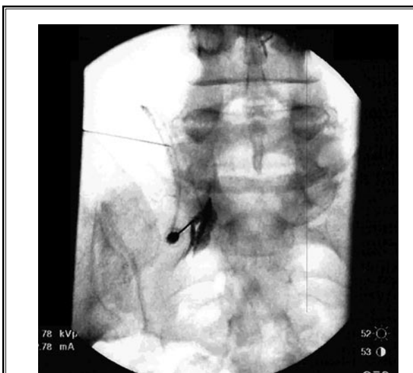
Fig. 2. S1 transforaminal epidural

ture, would also be likely to fail due to the preferential cephalad spread of blood in the lumbar epidural space, as well as the postoperative epidural fibrosis. A caudal approach with catheter was also considered, but the sacral dermal ulceration eliminated this pathway. There are anecdotal reports of using a myelogram to detect the site of the leak. In this case we chose to perform the blood patch without doing a myelogram as it is much less invasive with minimal patient risk and avoided needless x-ray exposure. We therefore decided to perform a transforaminal epidural blood patch