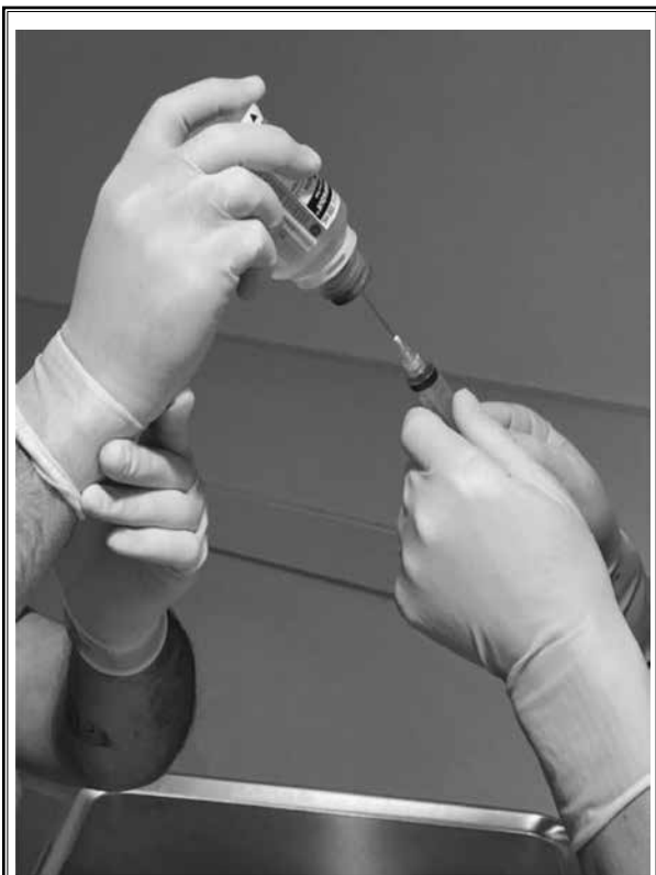
Fig. 2. Sterilely withdrawing iohexol.