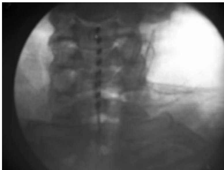
Fig.2. Dual electrode leads were placed at C3, 4, and 5 in a staggered array just off midline

Excellent stimulation was obtained at low amplitudes resulting in decreased pain and improved exercise tolerance. A permanent system was implanted without adverse events (Eon, Advanced Neuromodulation Systems, Plano, Texas). Over the next 3 months, all lesions healed, all evidence of ischemic disease resolved on exam, and the patient markedly reduced her oral opioids. The patient found a need to use continuous stimulation. On a few occasions, the patient turned the system off for more than 3 hours and experienced a return of her ischemia. This suggests an ongoing