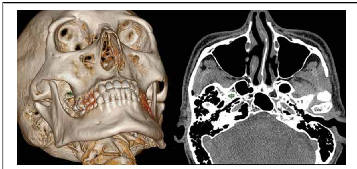
Fig. 2. After marking the hole identified as the FO with “+,” this mark is visualized in the axial view.

assessed as having grade 3 visibility, 28 scans were assessed as having grade 2 visibility according to observer 1. Seventy-five of the 100 scans were assessed as hav-