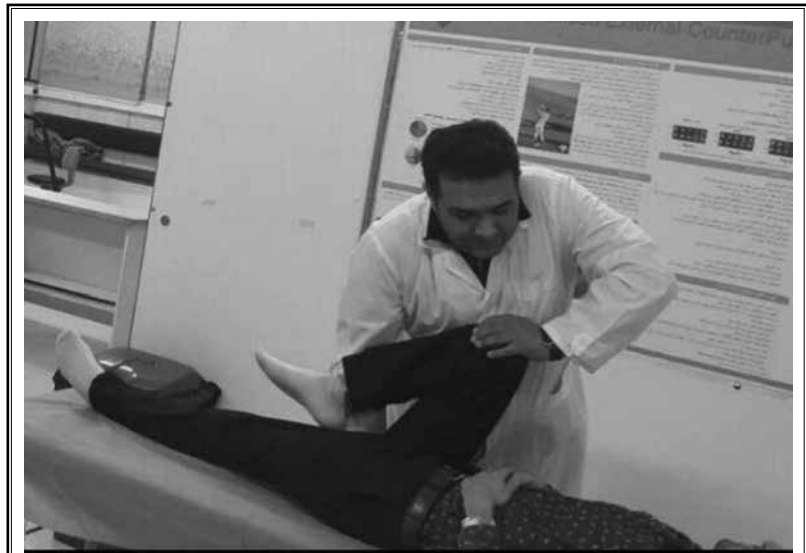
Fig. 1. Posterior innominate mobilization.

In the MT group, 2 manual maneuvers of posterior innominate rotation were implemented: i.e., posterior innominate mobilization and SIJ manipulation as shown in Figs. 1 and 2,, respectively. It is to be noted that the former is low-velocity and low-amplitude, while the latter is high-velocity and low-amplitude. The maneuvers were performed in the first