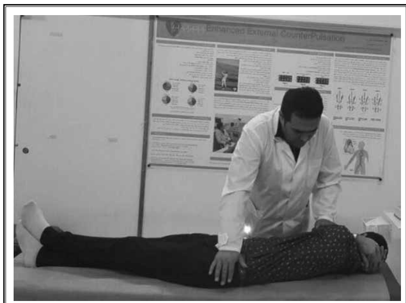
Fig. 2. SIJ manipulation.