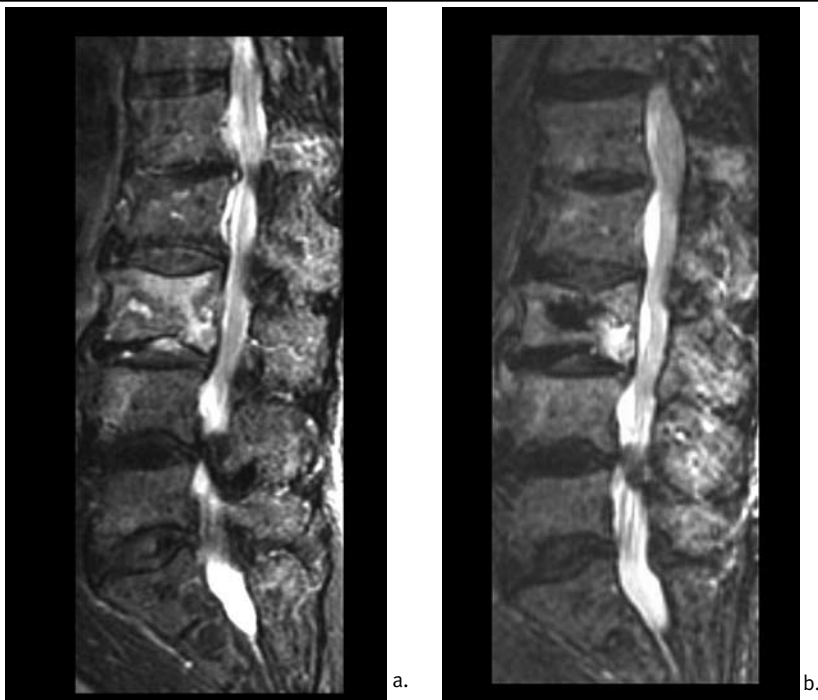
Fig 1. a. Short tau inversion recovery (STIR) sequence performed at presentation of acute-on-chronic low back pain shows T2-weighted hyperintense signal in the L3 vertebra consistent with acute compression fracture. b. Sagittal STIR sequence performed after vertebral augmentation shows T2-weighted hypointense signal in L3 consistent with PMMA cement.

mcg/dL. The steroids were discontinued thereafter. The patient denied any steroid supplementation for the 2 years prior to procedure. He had no previous history of hypotension of Addisonian crisis during this time.