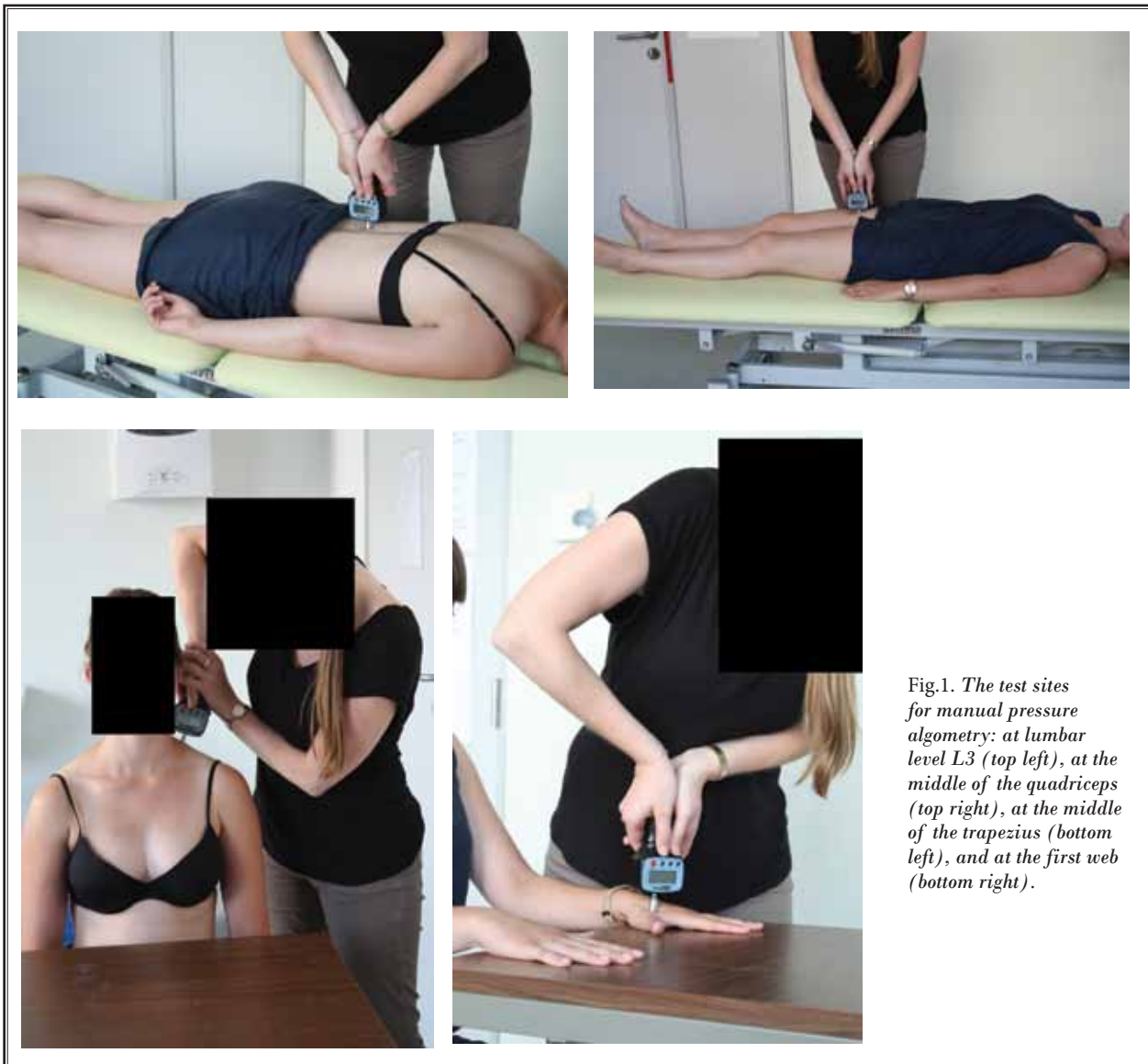
Fig.1. The test sites for manual pressure algometry: at lumbar level L3 (top left), at the middle of the quadriceps (top right), at the middle of the trapezius (bottom left), and at the first web (bottom right).