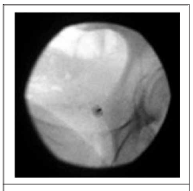
Fig. 3. Neurotherm needle placement at teh ischial spine.

For this therapeutic procedure, a right transgluteal approach with a target of the ischial spine was again utilized, and proper placement of the ablation needle was confirmed by eliciting paresthesias into the right vaginal area with 50 Hz stimulation at 0.8 V (Fig. 3). Pulsed radiofrequency ablation was performed for 240