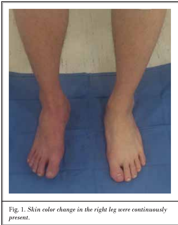
Fig. 1. Skin color change in the right leg were continuously present.

Most cases of CRPS occur after some inciting injury such as sprain, fractures, crush injuries, surgery to a limb, or burns (3,4). However, CRPS can start without any injury or surgery. It can also be triggered by central nervous system damage such as a herniated intervertebral disc (HIVD), spinal cord injury, or stroke. There are few cases of CRPS after an operation for disc disease such as discectomy, artificial disc surgery, and foraminotomy (5,6). CRPS from a mild HIVD without surgical intervention is even rarer than CRPS after an operation for disc disease.