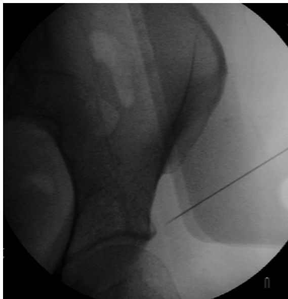
Fig. 1. A radiograph showing the entry point of the needle inserted into the LFCN approximately 1 cm medial to the anterior superior iliac spine (ASIS). AVG, average

A few case studies recently reported a favorable outcome of pulsed radiofrequency (PRF) neuromodulation to the LFCN as an alternative treatment (6-8). In the current study, we present the clinical outcomes of 11 patients with MP treated using PRF neuromodulation.