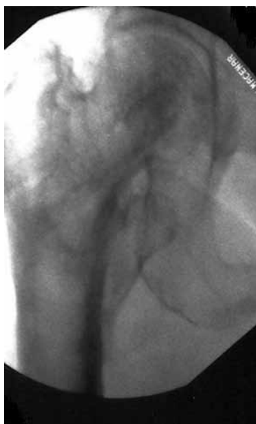
Fig. 1. Plain-film x-ray showing the larger-than-usual right lesser trochanter in contact with ischial bone.

A 73-year-old woman with a 12-year history of seropositive rheumatoid arthritis and a 2-year history of established osteoporosis presented with persistent pain in the right gluteal area, thigh, and leg secondary to epileptic seizure one month prior. A compression hip screw and metal plate had been placed to treat a right femoral neck fracture 8 years earlier and removed after 4 years. On physical examination, right hip flexion was free and painless although internal-external rotations and the psoas test elicited pain; extension was blocked. Plain-film x-rays showed an unusually large lesser trochanter contacting the ischium (Fig. 1). Besides the total narrowing of the ischiofemoral space, magnetic resonance imaging (MRI) showed a small area of osteonecrosis in the posterior and internal aspect of the femoral head and iliopsoas tendonitis. Selective injection of 1 mL iohexol-40 on the lesser trochanter of the femur resulted in a contrast cap-like image depicting "bursitis de novo" over the lesser trochanter (Fig. 2). Finally, injecting 40 mg triamcinolone in 2.5 mL 0.25% bupivacaine brought about transient pain relief and increased mobility on hip extension. One month later, selective injection at the distal insertion of the psoas muscle on the lesser trochanter of the femur, as described elsewhere (1), achieved 30% pain relief on the visual analogue scale (VAS). The patient underwent physiotherapy without success; 8