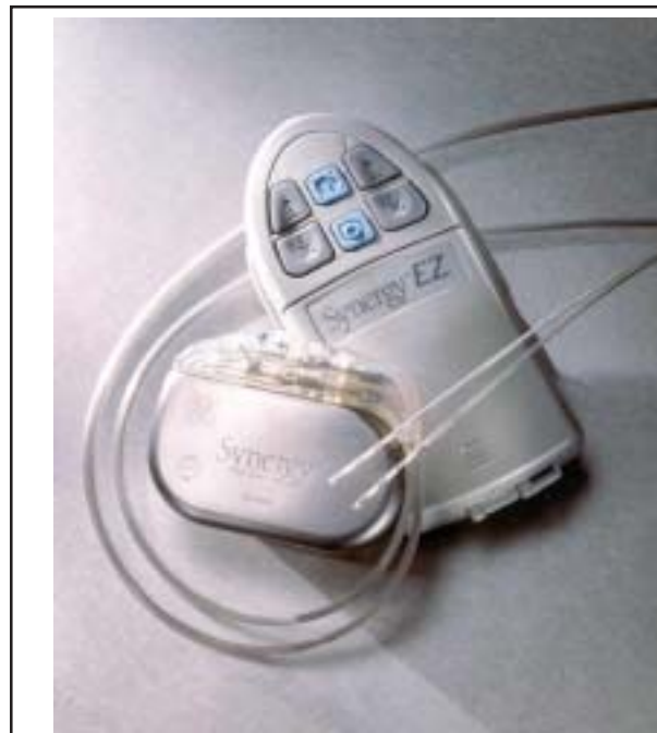
Fig. 1. Spinal cord stimulation lead, an extension cable, a power source/ pulse generator and patient programmer

The permanent spinal cord stimulation hardware consists of a spinal cord stimulation lead, an extension cable, a power source, and a pulse generator (Figs. 1 and 2). Many