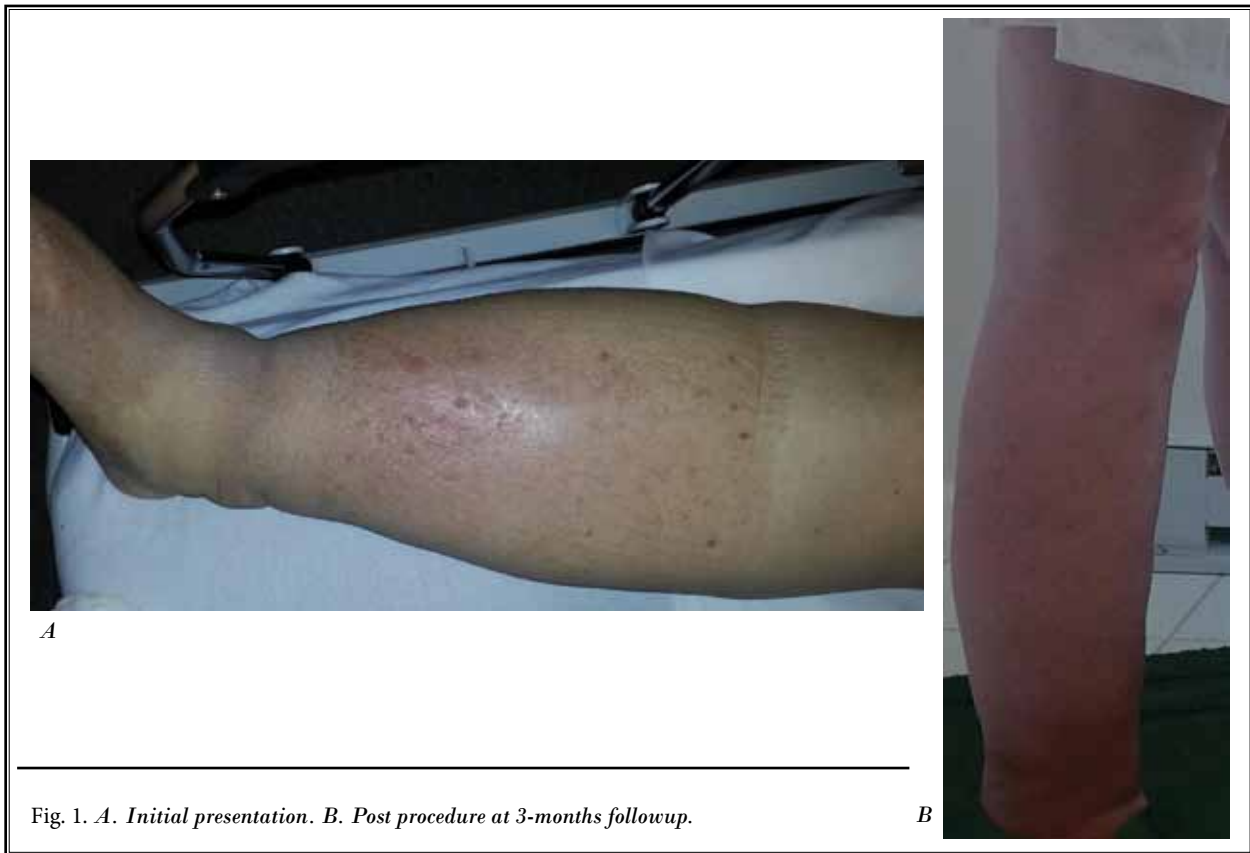
Fig. 1. A. Initial presentation. B. Post procedure at 3-months followup.