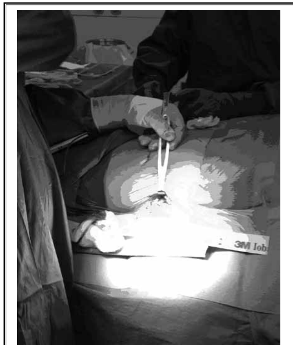
Fig. 4. Incision site.

Our patient had follow-ups at one week, 2 weeks, one month, 6 weeks, and 3 months after surgery. Our patient reported pain on VAS as 1 – 2 out of 10 with 80% – 90% relief consistently. She reported reduction in her pain medication consumption by more than 50%. She has cut down her gabapentin from 3200 mg to 1800 mg daily dosage. Occasionally she takes one tablet of oxycodone/acetaminophen 5/325 per day or celecoxib 200 mg per day, which she claims she takes for knee arthritis. No side effects or complications were reported from surgery. She reported some soreness at the surgery site up to 2 weeks after surgery. She is now able