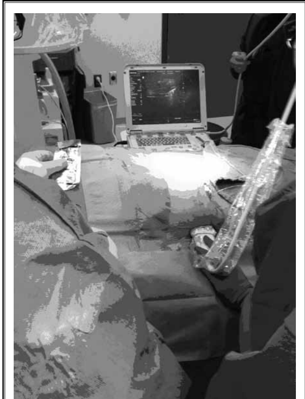
Fig. 3. Ultrasound-guided lead placement.

The trial was done for 5 days. Our patient reported 90% relief in abdominal pain and back pain and had cut down on pain medication use significantly. Since our patient achieved good responses during the trial phase, we decided to proceed with permanent implants.