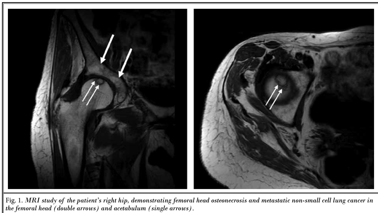
Fig. 1. MRI study of the patient's right hip, demonstrating femoral head osteonecrosis and metastatic non-small cell lung cancer in the femoral head (double arrows) and acetabulum (single arrows).

Seventy-two hours after the diagnostic block the patient received thermal radiofrequency ablation of the lateral femoral cutaneous nerve (LFCN), femoral nerve branches to the femoral head, and obturator nerve branches to the femoral head. The patient was placed in the supine position and her right hip was prepped and draped in the standard sterile manner using chlorhexidine swabs. The LFCN was identified by standard ultrasound approach, as described by Fowler et al (1) (Fig. 2). A 21 Ga radiofrequency cannula was placed in proximity to the lateral femoral nerve, resulting in sensory paresthesia at 0.7 V with no motor response. The LFCN was blocked with a combination of lidocaine 2% with triamcinalone acetate 80 mg and clonidine 50 mcg, and subsequently ablated at 80°C for 80 seconds, using a similar technique described by Fowler et al (1), although in this case using thermal ablation. The femoral nerve sensory branches to the head of the femur were blocked with the aforementioned nerve block solution and then ablated using a lateral approach described by Kawaguchi et al (2), using thermal ablation at 80°C for 80 seconds. Prior to ablation we observed a good sensory paresthesia response at 0.7 V with no motor response.