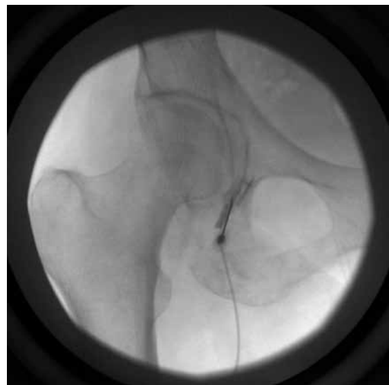
Fig. 3. Anterior placement of a radiofrequency needle abutting the acetabulum, having been passed between the femoral artery and femoral vein with ultrasound.

In this case report we used thermal radiofrequency ablation of the femoral and obturator nerve branches to the femoral head. We used an anterior approach to the obturator branches, passing the radiofrequency needle between the femoral artery and vein with combined ultrasound and fluoroscopic guidance. To our knowledge, a combined ultrasound and fluoroscopic guided approach, so as to avoid the femoral vessels,