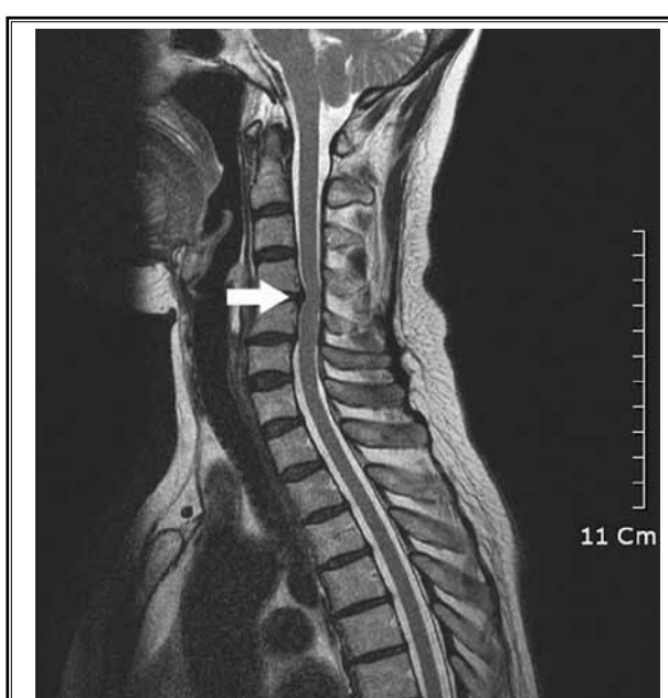
Fig 2. A 55-year-old woman with cervical canal stenosis. Sagittal T2-weighted fast spin-echo image shows grade 2 stenosis at the C4-5 level (arrow). The spinal cord is compressed and deformed but displays no signal changes.

of pathology, as determined by MRI. Adhesiolysis was then carried out, and the final positioning was achieved in the epidural space and into the lateral and ventral epidural space. Following the satisfactory positioning of the catheter, at 0.5-1 mL of contrast was injected (Fig. 4). If no subarachnoid, intravascular, or other extra epidural filling occurred and satisfactory filling was obtained with the epidural and targeted regions, 5 mL of 0.2 % preservative-free ropivacaine containing 1,500 units of hyaluronidase and 4 mg of dexamethasone was injected. To reduce the chance of loculation of the injected contents, the slow injection continued until the contrast was seen exiting the neural foramen from the epidural space, after which the patient was asked to rotate their head and neck from left to right (chin tuck rotation). One hour following the procedure, 6 mL of 10% sodium chloride solution was epidurally infused over 30 min in the recovery room under monitoring. The intravenous line and epidural catheter were removed and the patient was discharged if all parameters were satisfactory. The first follow-up was performed 2 weeks following the procedure. During this time, all subjects received non-steroidal anti-inflammatory drugs (NSAIDs) and muscle relaxants. In addition, patients who were non-responsive to this therapy were given opioid