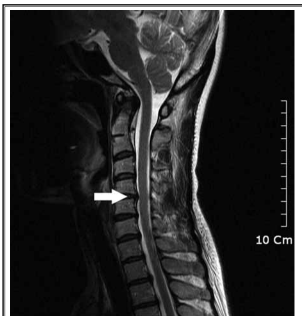
Fig 1. A 43-year-old woman with cervical canal stenosis. Sagittal T2-weighted fast spin-echo image shows grade 1 stenosis with obliteration of CSF space exceeding 50% of the arbitrary subarachnoid space at the C4-5 level (arrow).