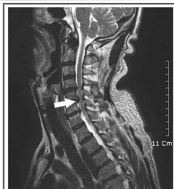
Fig 3. A 52-year-old man with cervical canal stenosis. Sagittal T2-weighted fast spin-echo image shows grade 3 cervical canal stenosis at the C5-6 level (arrow). The spinal canal is significantly narrowed at this level, and the signal intensity of the spinal cord is increased at the corresponding level.

of pathology, as determined by MRI. Adhesiolysis was then carried out, and the final positioning was achieved in the epidural space and into the lateral and ventral epidural space. Following the satisfactory positioning of the catheter, at 0.5-1 mL of contrast was injected (Fig. 4). If no subarachnoid, intravascular, or other extra epidural filling occurred and satisfactory filling was obtained with the epidural and targeted regions, 5 mL of 0.2 % preservative-free ropivacaine containing 1,500 units of hyaluronidase and 4 mg of dexamethasone was injected. To reduce the chance of loculation of the injected contents, the slow injection continued until the contrast was seen exiting the neural foramen from the epidural space, after which the patient was asked to rotate their head and neck from left to right (chin tuck rotation). One hour following the procedure, 6 mL of 10% sodium chloride solution was epidurally infused over 30 min in the recovery room under monitoring. The intravenous line and epidural catheter were removed and the patient was discharged if all parameters were satisfactory. The first follow-up was performed 2 weeks following the procedure. During this time, all subjects received non-steroidal anti-inflammatory drugs (NSAIDs) and muscle relaxants. In addition, patients who were non-responsive to this therapy were given opioid