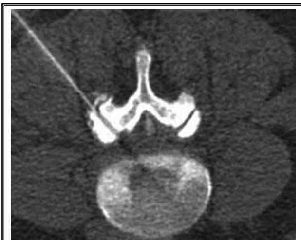
Fig. 3. CT-guided aspiration of the right L4-5 facet joint. Note contrast is seen in the dorsal epidural cyst, confirming a connection exists with the facet joint.

month follow-up, her only residual symptom was some continued numbness in the right lower limb in the L5 distribution.