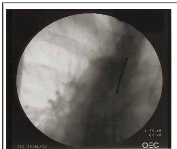
Fig. 1. PA view of the octet electrode lead at the level of the T3 vertebral body inferior endplate, just right of midline.