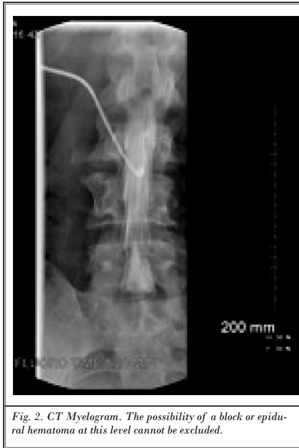
Fig. 2. CT Myelogram. The possibility of a block or epidural hematoma at this level cannot be excluded.

studies were normal. The patient was not on any anti-platelet medications or anticoagulants. On post-operative day #5, the patient underwent a thoracic T8-9 laminectomy with excision of epidural hematoma and removal of spinal cord stimulator electrodes. Per report; there were no post-operative complications and the patient tolerated the procedure well. A follow up MRI of the thoracic spine revealed cord edema at T8 through the conus medullaris and a large herniated disc at T8/9 and T9/10.