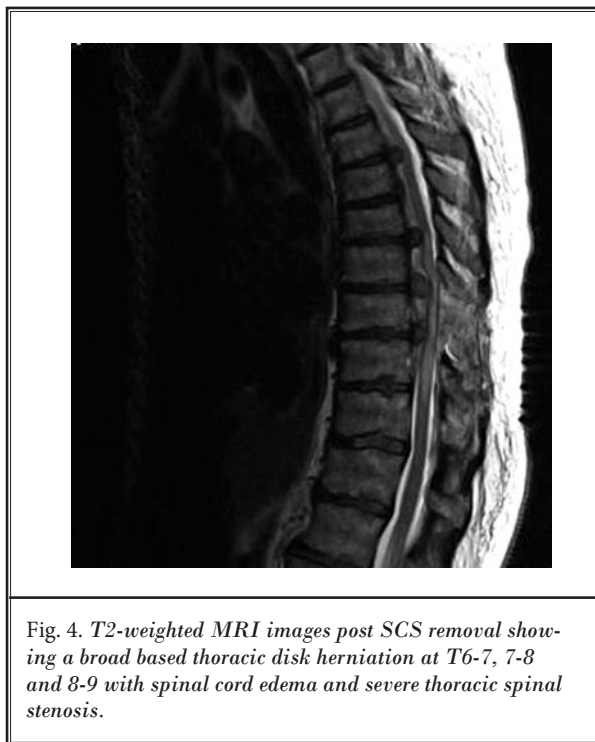
Fig. 4. T2-weighted MRI images post SCS removal showing a broad based thoracic disk herniation at T6-7, 7-8 and 8-9 with spinal cord edema and severe thoracic spinal stenosis.

The spinal cord stimulator was removed and the patient underwent an MRI scan which showed a large thoracic disk herniation at T6-7, 7-8 and 8-9 with spinal cord edema and severe thoracic spinal stenosis. The patient was placed on IV steroids. CT scan of the thoracic spine showed multilevel partially calcified disc herniations at T6-7, 7-8 and 8-9 (Fig. 4). At T6-7 there was a large partially calcified anterior soft tissue density suspicious for a large calcified disc herniation with severe central canal compromise, reducing the AP diameter of the thecal sac to 5 mm. At T7-8 there was a large left