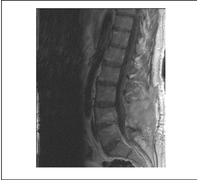
Fig. 1. Sagittal T1 weighted post gadolinium image demonstrating enhancement in the anterior epidural space, and increased signal posteriorly at the L4/5 and L5/S1 discs. A previous laminectomy is evident, and there is enhancement in the lumbar soft tissues as well.