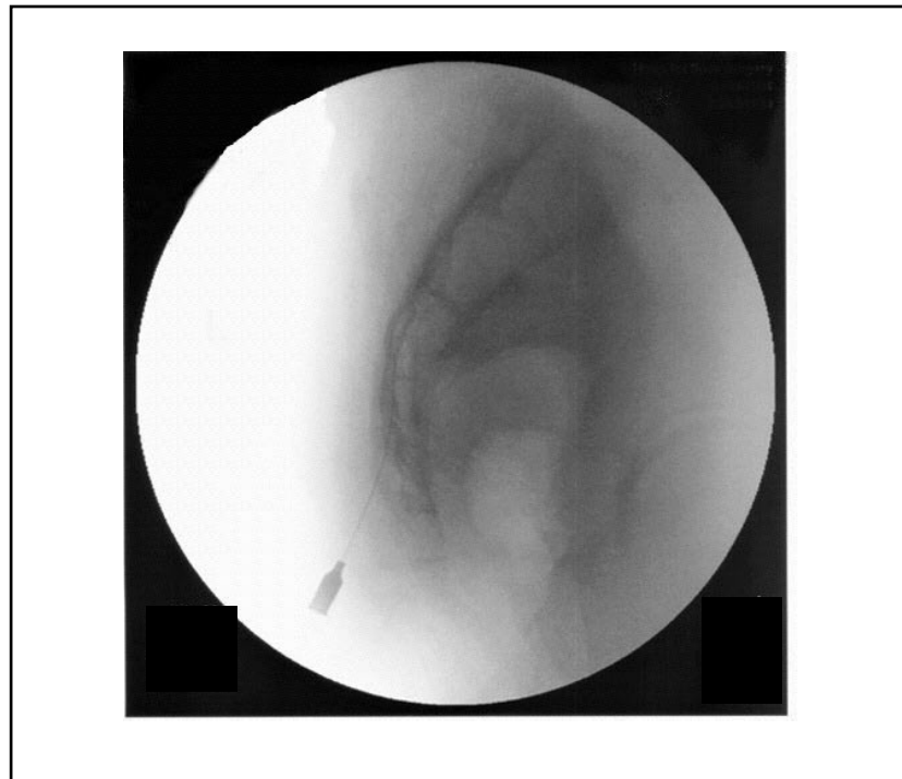
Fig. 2. Fluoroscopic lateral view of caudally placed epidural steroid injection