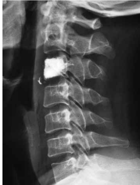
Fig. 6. Paravertebral cement leakage was found in one patient with symptomatic C3 VH.

PVP technique involves injection of acrylic cement, usually PMMA, into the vertebral body. The mechanism of action for this procedure is not entirely clear, but it