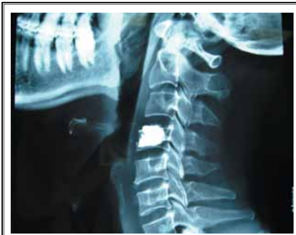
Fig. 5. Postoperative lateral radiograph revealed adequate and homogeneous cement distribution.

tion was halted if PMMA began to escape the vertebral body into vasculature, through an endplate into a disc, or into the posterior aspect of the vertebral body near the thecal sac. After surgery, the patient was ordered to lie down for 2 hours, before gradually sitting up and walking slowly. They were also given post-procedural instructions including avoidance of strenuous activity for 24 hours.