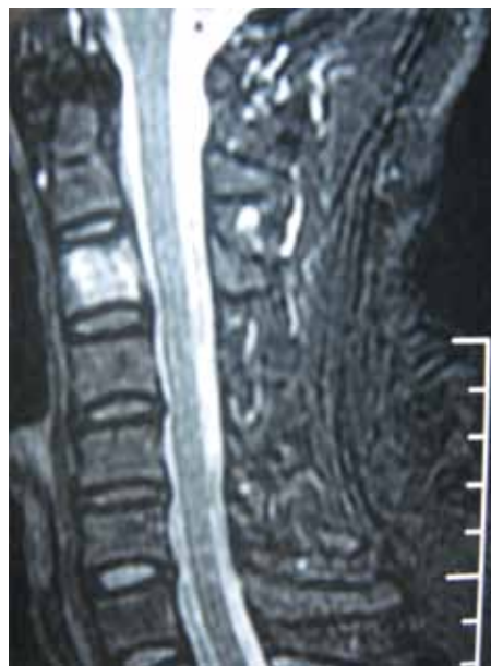
Fig. 2. T2-weighted sagittal MRI showed well-distributed high signals.